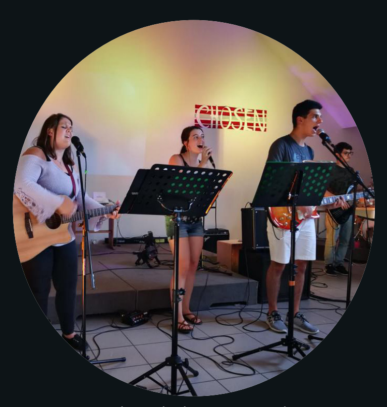
Worship Service in Brussels, Belgium at Converge 2018