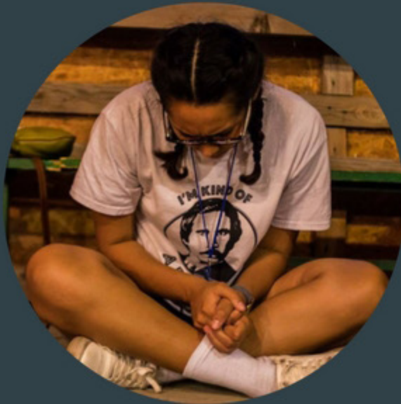
An Awakening intern taking time to pray

So... Can a generation change the world? The answer is yes! Yes we can!