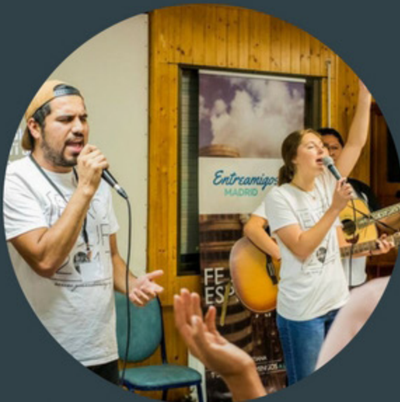
The Awakening leading worship in Spain