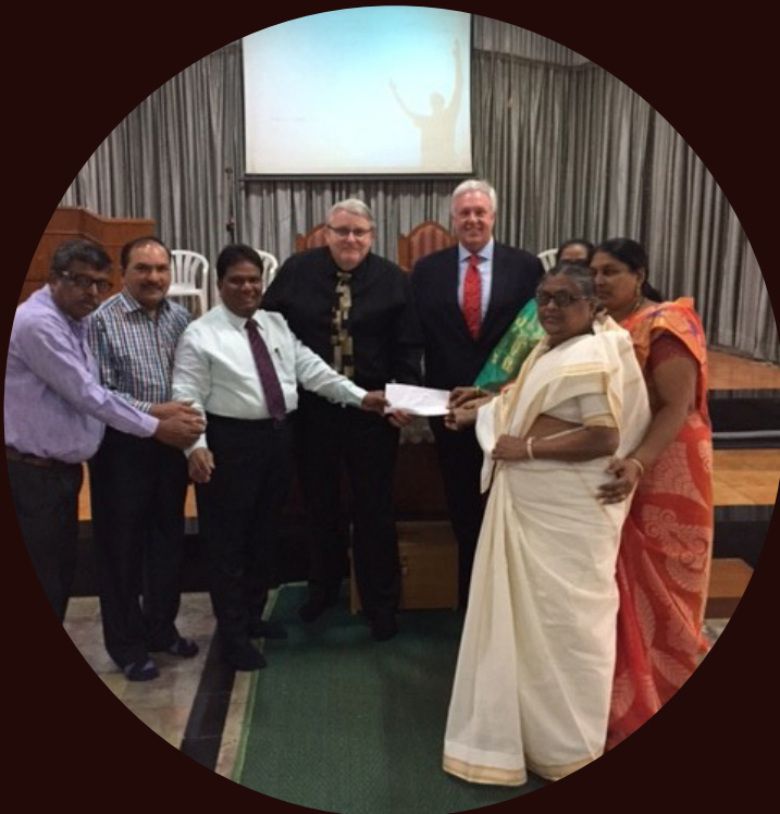
First Global Outreach Offering of 2018