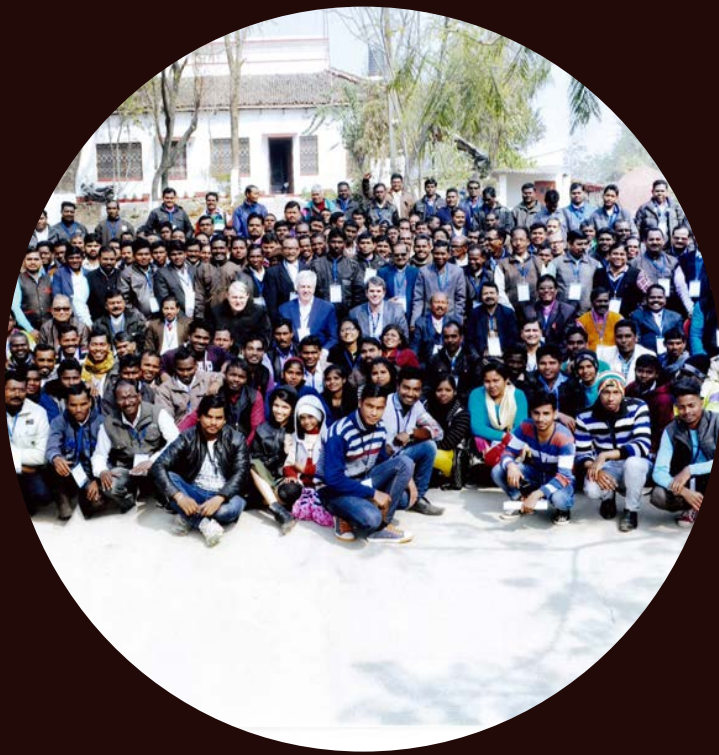
Annual Northern India Conference