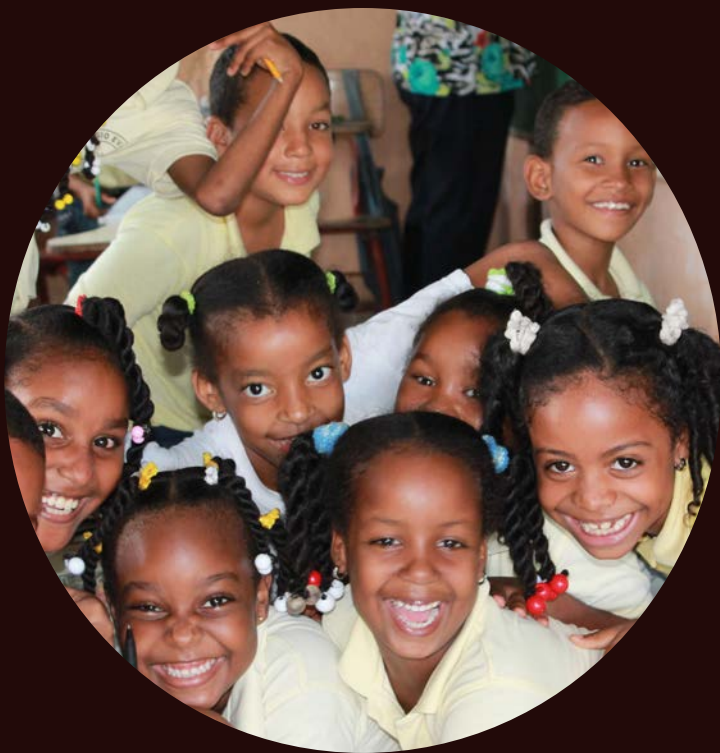
Child Sponsorship Children

"MERE IMPROVEMENT IS NOT REDEMPTION, THOUGH REDEMPTION ALWAYS IMPROVES PEOPLE."