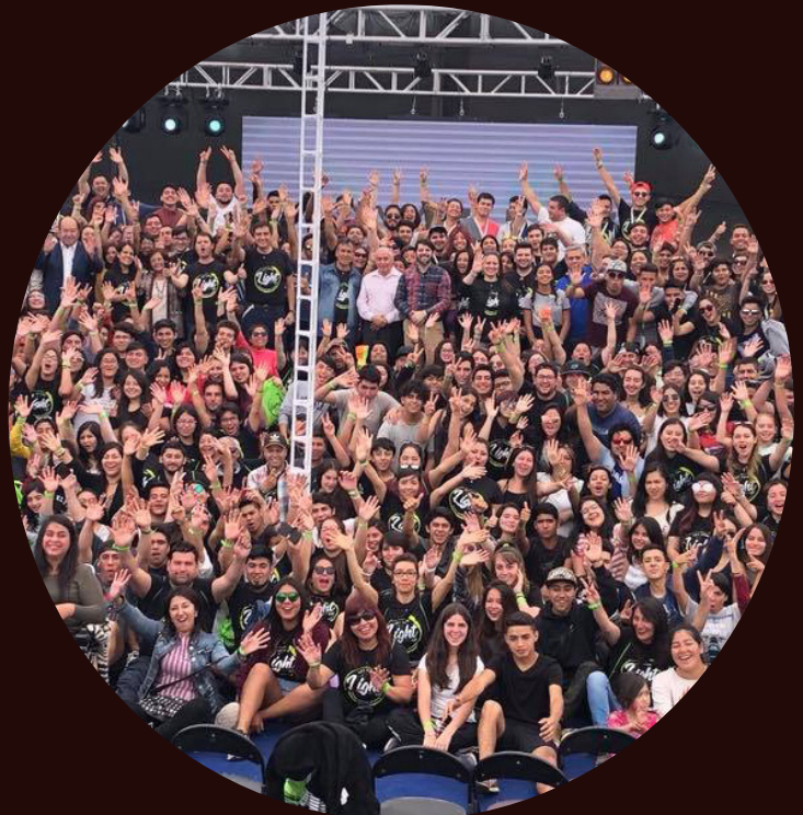
Annual Chile Youth Conference

It was encouraging to see over 1,500 young adults worshipping the King and praying for young people into the wee hours of the night because they could not get enough Jesus. Knowing that the core of the individuals running the camp were the kids at the altar in 2012, reminded us of our mission at The Awakening: To see a revival start in the heart of every young person in our movement around the world!