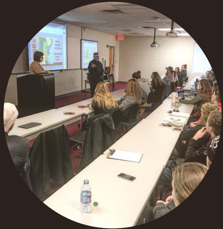
SEND Week at Emmanuel College