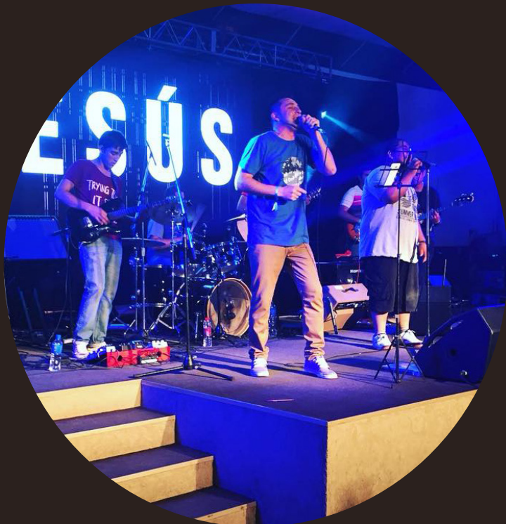
LAMCAR Quest 2018