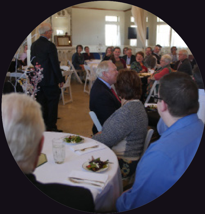
Celebrating Extension Loan Fund's 60th year