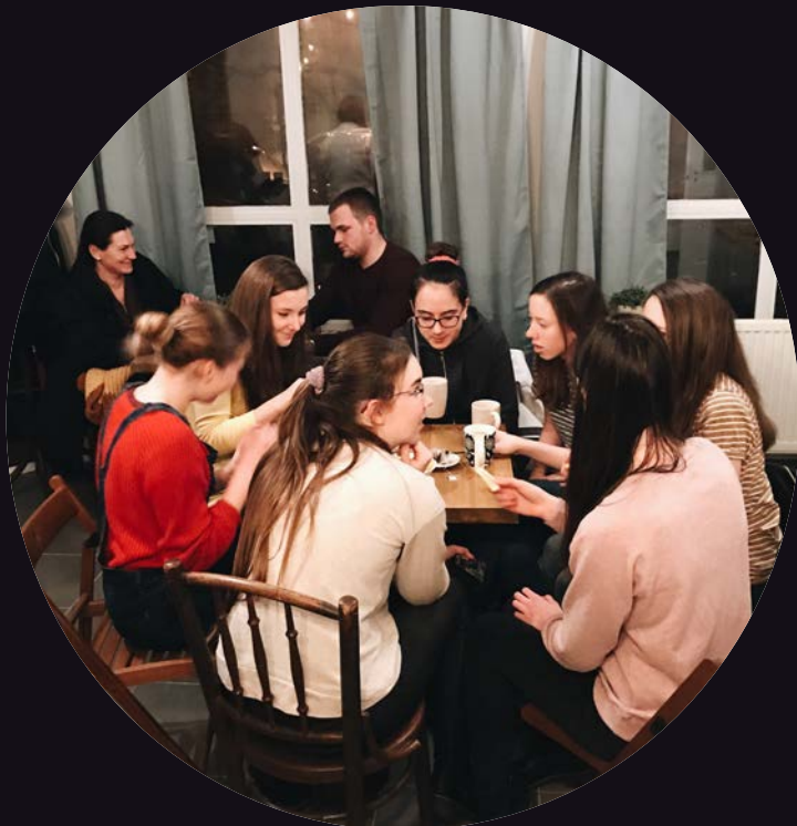
People gather at the opening night for TAB Coffeehouse in Hungary

On March 16, The Awakening International Base launched the grand opening of TAB Coffeehouse in Hungary! It is so exciting to finally have a space where we can strengthen our connection with this community, build lasting relationships, and share the Good News. Thank you to everyone who has been helping us get across the finish line, both financially and with your prayers. We believe this is only the beginning of something incredible, as we continue to serve and disciple this generation!