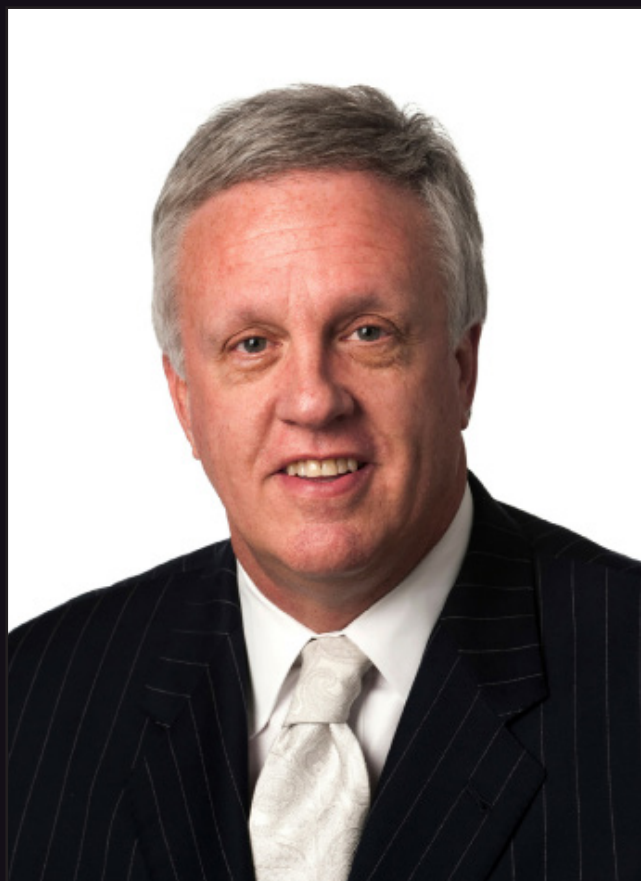
Bishop Talmadge Gardner

"As long as there are people with no access to the gospel we must continue to send those who will proclaim Christ to the nations. North American missionaries are serving in every corner of the globe – from high mountains, to small islands, from the wilderness to the mega-city. We pray the Lord of the harvest will continue to raise up workers who will go!"