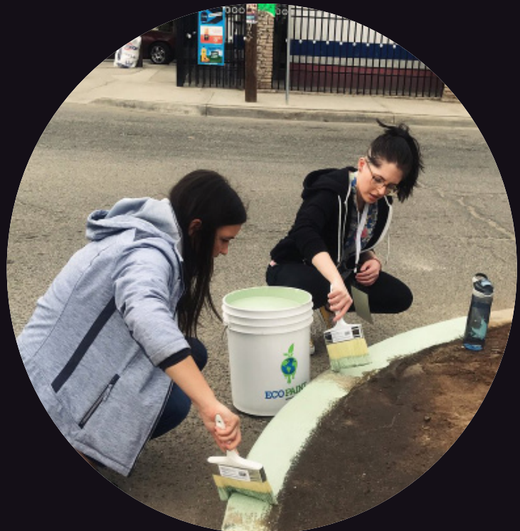
The Awakening serving in Mexicali

"WE MAKE A LIVING BY WHAT WE GET, WE MAKE A LIFE BY WHAT WE GIVE." - WINSTON CHURCHILL