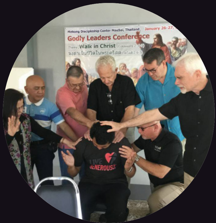
Prayer over the Mekong Discipleship Center director

The 2018 Awakening traditional interns spent our Spring Break serving the city of Mexicali. There, we were given opportunities to minister, as well as love on and be loved on by the wonderful people of Iglesia El Shadai and the surrounding community. The Awakening served the Mexicali community, alongside the church's interns, by taking them out and teaching them a new way to evangelize in the streets. Our interns were given the opportunity to lead workshops and a worship service for the El Shadai interns and worship teams. We also visited an orphanage and loved on some of the sweetest children that I have ever met. What impacted me most about the trip was the way that Iglesia El Shadai welcomed us with open arms. They went above and beyond to make our Awakening team feel like we were at home, and many of us left wishing we could make Mexicali a forever home. Mexicali will forever have a special place in my heart, and I await the day that I am able to return.