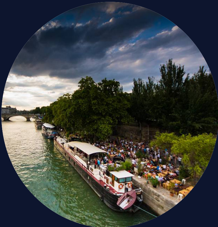
People gathering at Art Sur Scene