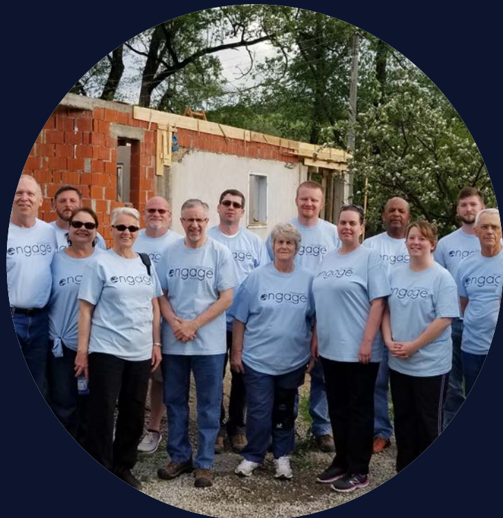
Missions Team in Romania