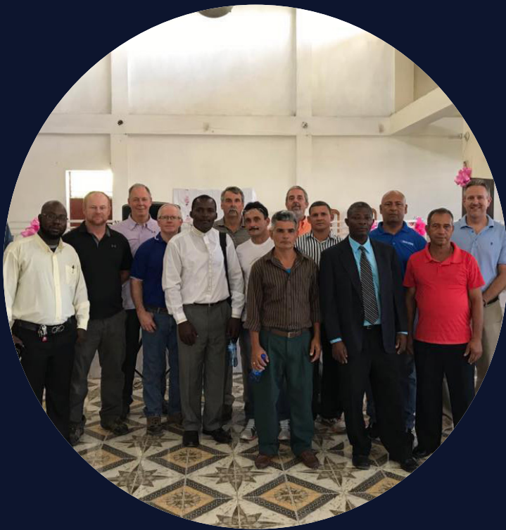
The Cuban/American Team in Haiti