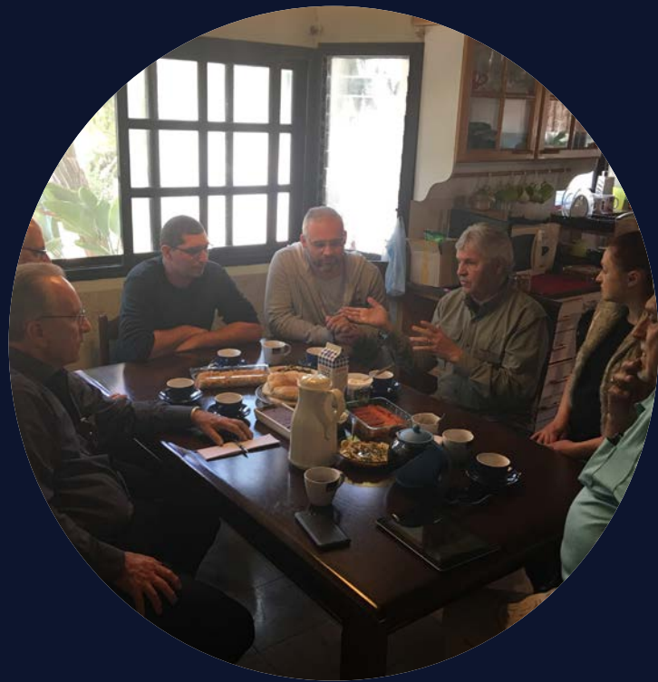
House Church in Israel

Jews and Arabs are being won to Christ! IPHC merged several years ago with Living Israel Ministries and, for the last 20 years, they have been winning these people to Yeshua. Many of the people who are being saved are from drug and alcohol backgrounds. Through their drug rehabilitation houses, they have now grown into 28 house churches that are filled with believers who are on fire for Christ. The goal is to have a total of 100 house churches in Israel, and you can help make this happen through our "Adopt an Israeli House Church" program. You or your church can: pray for, have two-way communication with, financially jump start, and even have face to face visits with the people involved in these churches. For more information, email Bob Cave, Regional Director of Middle East and Eurasia, at bcave@iphc.org .