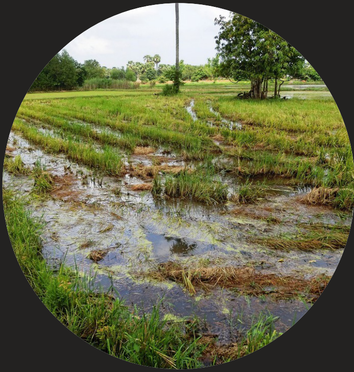
Land bought for the building of the Pursat Church.