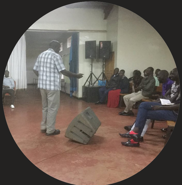
Young people attending a class on Church Leadership at Compass.

Because the Hope4Sudan graduates are passionate about working in the local church, this ministry will also focus much time and energy on imparting the necessary skills to effectively lead a congregation. Experienced pastors and church leaders will help teach practical classes such as Pastoral Care and Church Administration.