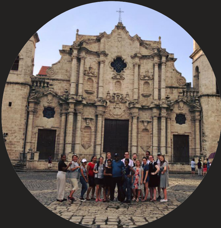
The Awakening team in Cuba.