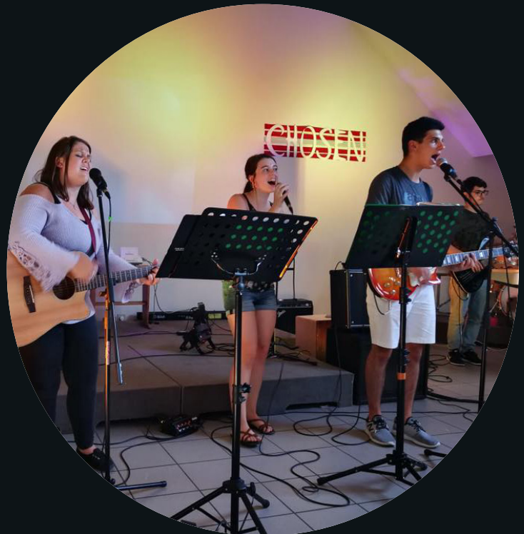
Worship Service in Brussels, Belgium at Converge 2018

Due to our goal of keeping each Converge Week under 50 participants, this year is a historical year as we are now conducting two locations, both in Brussels and Cardiff, Wales. In Cardiff, we have close to 50 participating from August 22-27, 2018.