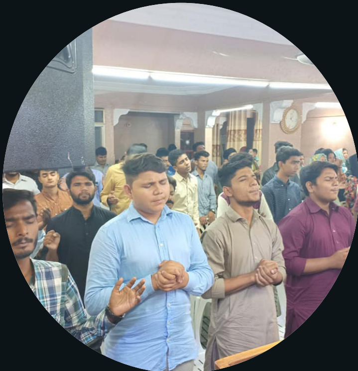
Youth Worshiping in Pakistan