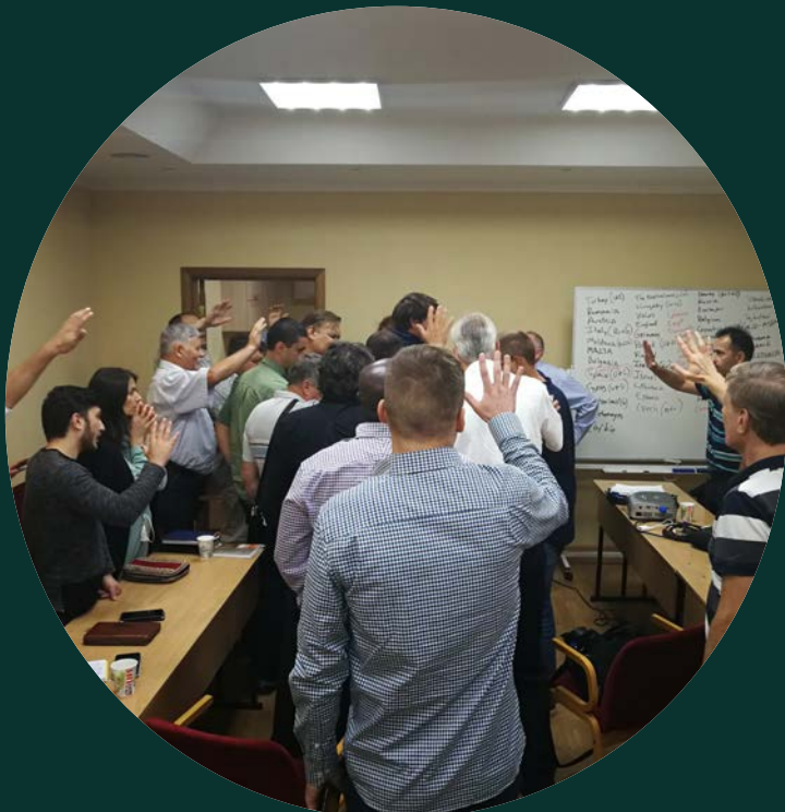
Leaders in Europe Praying for Kingdom Advancement