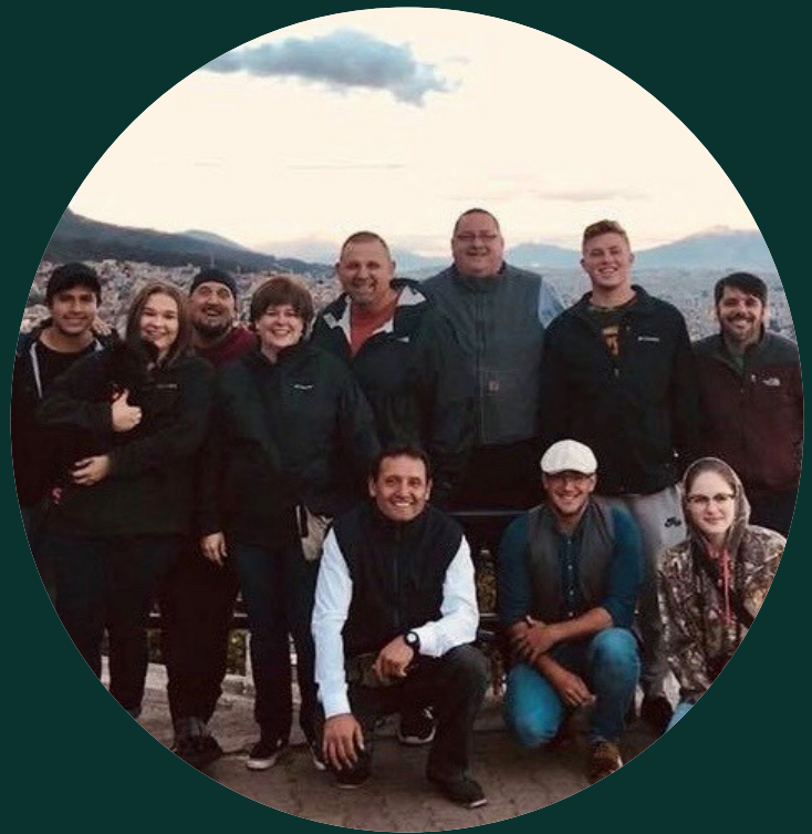
Group Photo in Ecuador