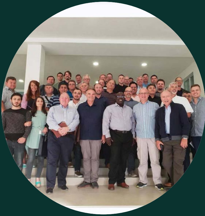
IPHC Europe's Leaders in Kiev, Ukraine