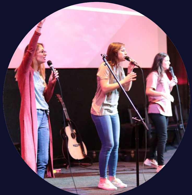
The Awakening Band Leading Worship in Amarillo, Texas

The Awakening was given an opportunity to take a team to Amarillo to minister to the youth of the Great Plains Conference, and what an opportunity it was. We were asked to plan an event that catered specifically to those who feel called to ministry, who are already active in ministry, or who are interested in ministry. We led worship, held workshops, played games, and were able to love on one another. The coolest thing was the way that everything did not go perfectly as planned, but it still seemed to go just the way it was supposed to. This trip was a huge reminder to constantly have our ears tuned to hear what the Lord is wanting and saying, so that His agenda comes to pass and not our own.