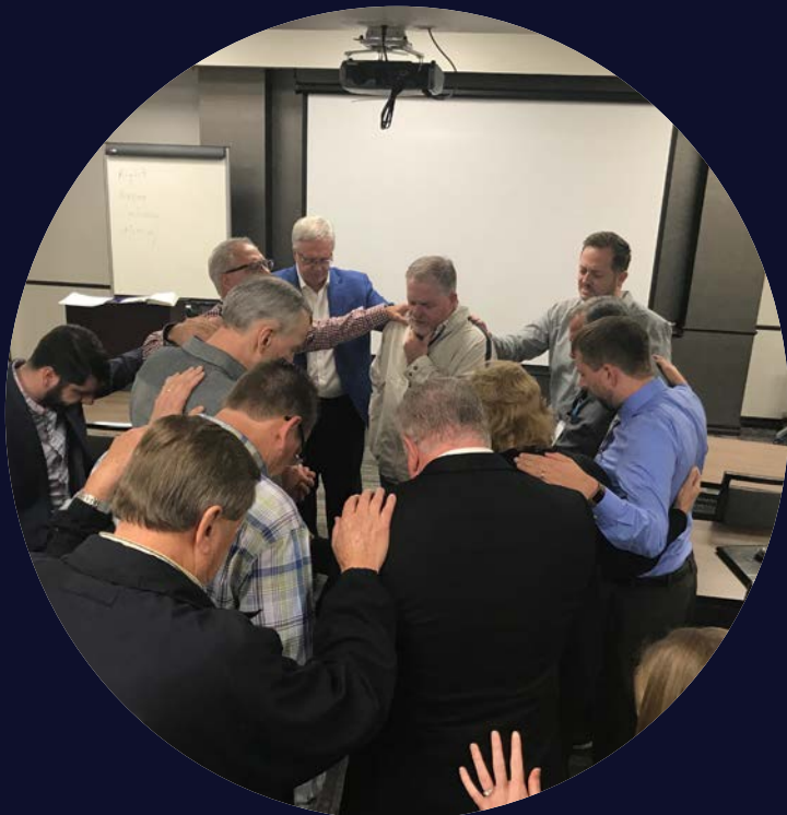
CMD Summit 2018