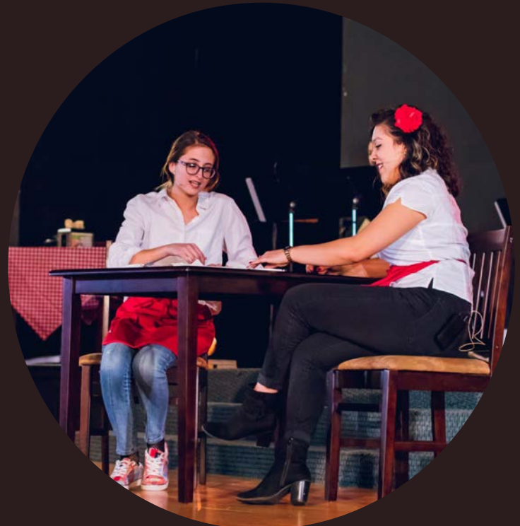
The Table Performance