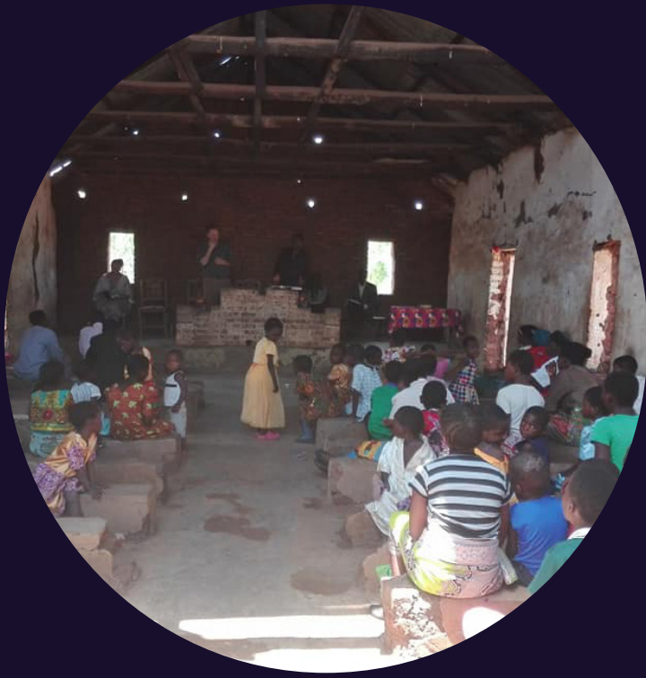
Sharon Church Congregation