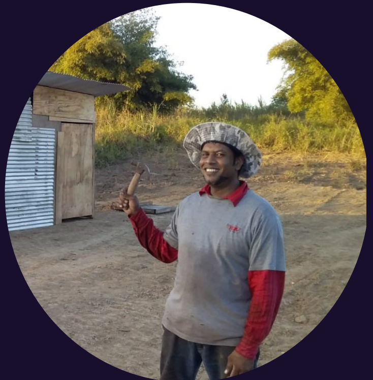
Working in Trinidad