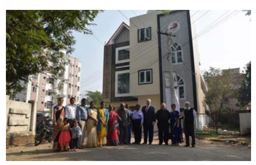
Invited guests to the new Living Waters PHC- Srikakulam

I had the privilege of traveling to India this month to dedicate the Living Waters PHC in Srikakulam, India. Many partnerships came together to see this building project come to fruition. Wing Kwong PHC in Hong Kong made the initial contribution as a part of their annual Five Loaves and Two Fishes missions' emphasis. This contribution was followed by an Antioch Grant in 2017-2018 and then a final grant from an undesignated bequest to WMM in 2018. In addition, the local congregation exercised their faith and sacrificially gave in excess of $50,000 USD toward this project over the course of a one-and-a-half-year period. The average daily wage in India is 272.19 Indian Rupees [INR] which