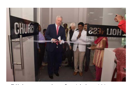
Ribbon cutting for Living Waters PHC- Srikakulam

equals $3.82 USD - this was a giant demonstration of faith on the part of this congregation.