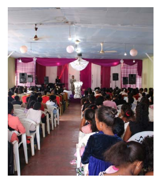
CURRENT CHURCH GROWING TO CAPACITY

If there is any way you can assist, no matter how much, it will be much appreciated. Donations can be made to IPHC World Missions Ministries Madagascar Church Project #16801P, or visit <a href="https://give.iphc.org/missions/270440">https://give.iphc.org/missions/270440</a> to give now.