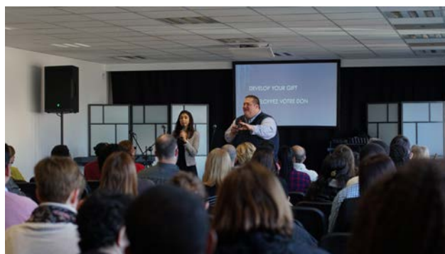
PREACHING AT THE BRIDGE