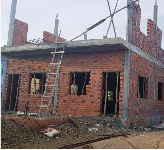
KAMPONG CHHNANG CHURCH