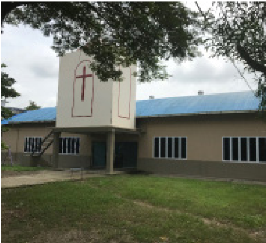
YANGON MINISTRY CENTER

To donate to this project, please earmark your check 76012P .