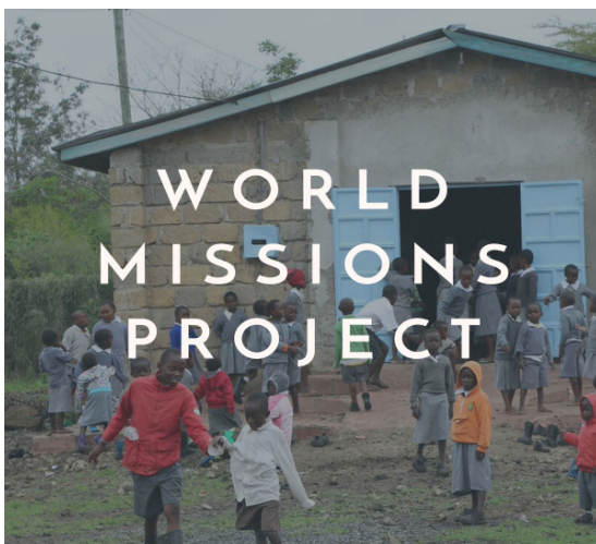
EASTERN EUROPE CHURCH PLANTS - NO PHOTO AVAILABLE

To donate to this project, please earmark your check 41006P .