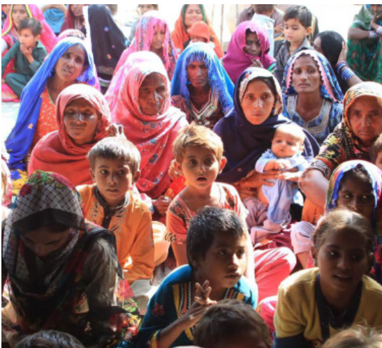
WATERWELLS IN PAKISTAN

To donate to this project, please earmark your check 26014P.