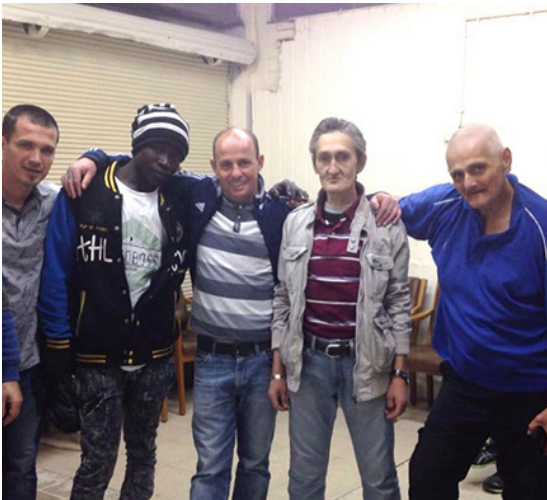
TEL AVIV COFFEE HOUSE

To donate to this project, please earmark your check 17011P .