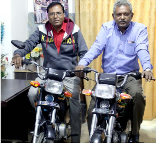
MOTORCYCLES FOR PASTORS