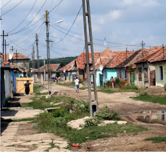
A VILLAGE IN TINCA, ROMANIA