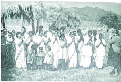
The hands say "hello."

Working among people who know very little or nothing of the Christian message is very interesting. One has varied experiences. One time while sitting on our front steps, I very earnestly explained to a woman the way of salvation and how to reach Heaven. She show-