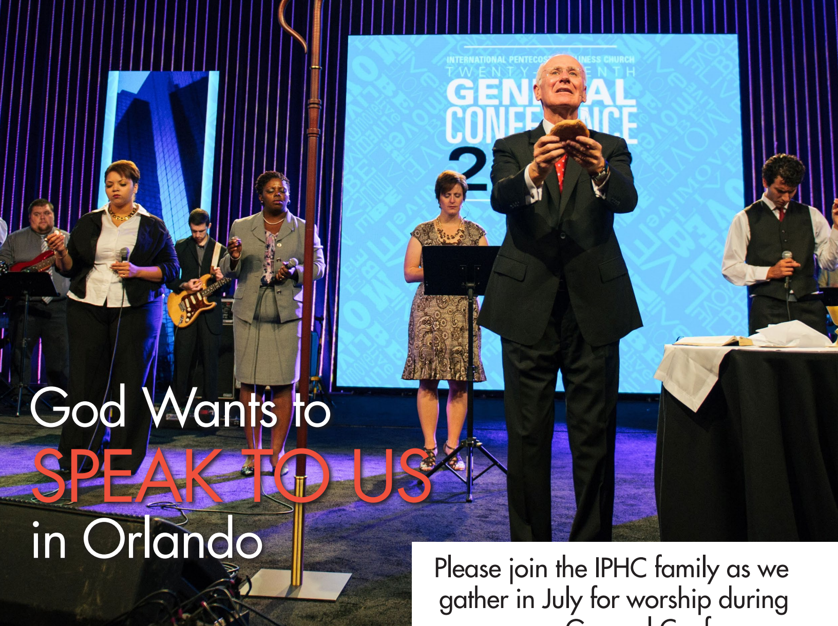
Do it again, Lord: A scene from the last General Conference in Dallas.

Please join the IPHC family as we gather in July for worship during our General Conference.