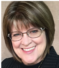
BY SUSAN BAGLEY

If you want to win as a leader, you need these four attitudes.