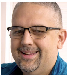
BY TRAVIS LOWE

I had to face some wrong beliefs in order to change my behavior. And now the results are obvious!