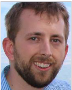
BY KEVIN SNEED

The church really can't expect to encourage sexual purity if we don't encourage genuine friendships.