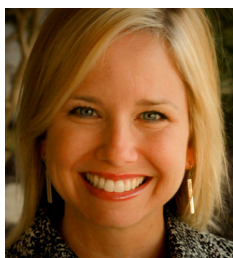
By SAMANTHA SNIPES

We are running a relay race. All generations must work together to fulfill God's plan.