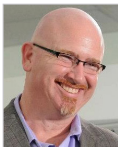
BY GREG HOOD

You will not walk in the fullness of the Spirit's power if you don't understand what He does for you.