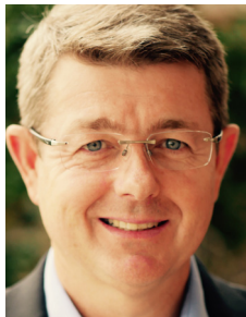
BY MATT BENNETT

The message of the gospel hasn't changed, but the way we take it to the world is rapidly changing.