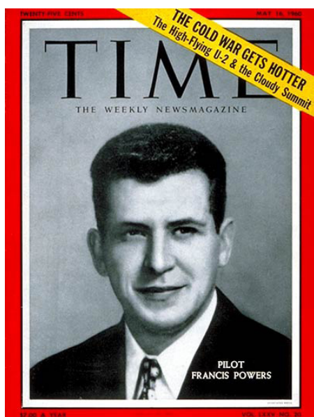
Francis Gary Powers died in a helicopter crash in 1977 because he ran out of fuel.

You have a responsibility to fulfill your ministry, but your responsibilities to God and family cannot be set aside. Plan well, establish priorities and goals for each part of your life and allow the Holy Spirit to be your guide.