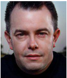
BY GREG TERRY

Many leaders today are burning out because they have not learned to refuel. Don't crash your plane!